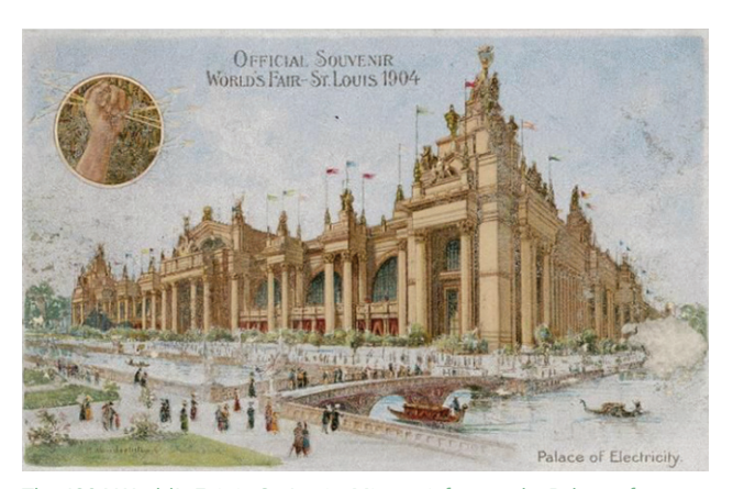
The 1904 World's Fair in St. Louis, Missouri, featured a Palace of Electricity meant to showcase the United States' achievements in commercializing electricity.

Conventions, exhibitions, movements, and other public gatherings help people communicate ideas and opinions with each other. For instance, World's Fairs (also known as World Expositions), in which nations showed off their most recent advancements, exploded in the 1800s. Visitors came from all over the world. Why might countries want to communicate their achievements? What specific ideas and information did the nations show the world, and why might that be important?