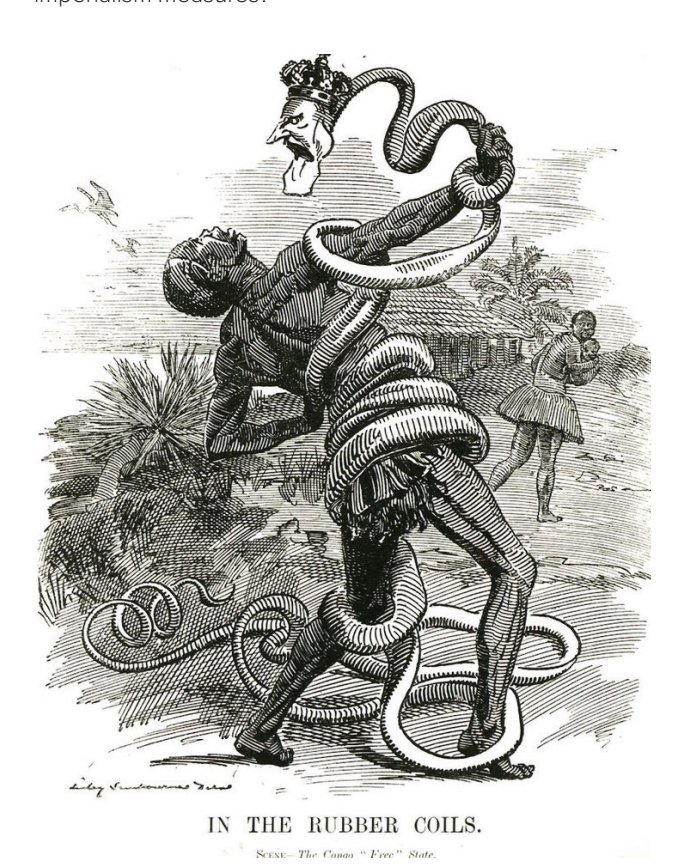
The 1906 political cartoon from Punch magazine highlighted social unrest around European imperialization of Africa.

Images and imagery, too, can communicate thoughts, opinions, or ideas. Portraits, photographs, and art convey meaning. Students might look to the cave paintings of earlier societies or the hieroglyphs and drawings created by Ancient Egyptians. What do those images convey about their society? Do they communicate what was deemed to be important whether it be about family, war, or society in general? Other examples might include satirical materials from England's Punch weekly magazine. In 1906, Punch ran "In the Rubber Coils," a political cartoon that depicted Belgium's King Leopold II as a rubber vine coiled around a Congolese man. What is the image trying to convey to the reader about the relationship between Europe and Africa? How do images communicate people's opinions on important political and social topics? How did political cartoons sway public opinion about support for antiimperialism measures?