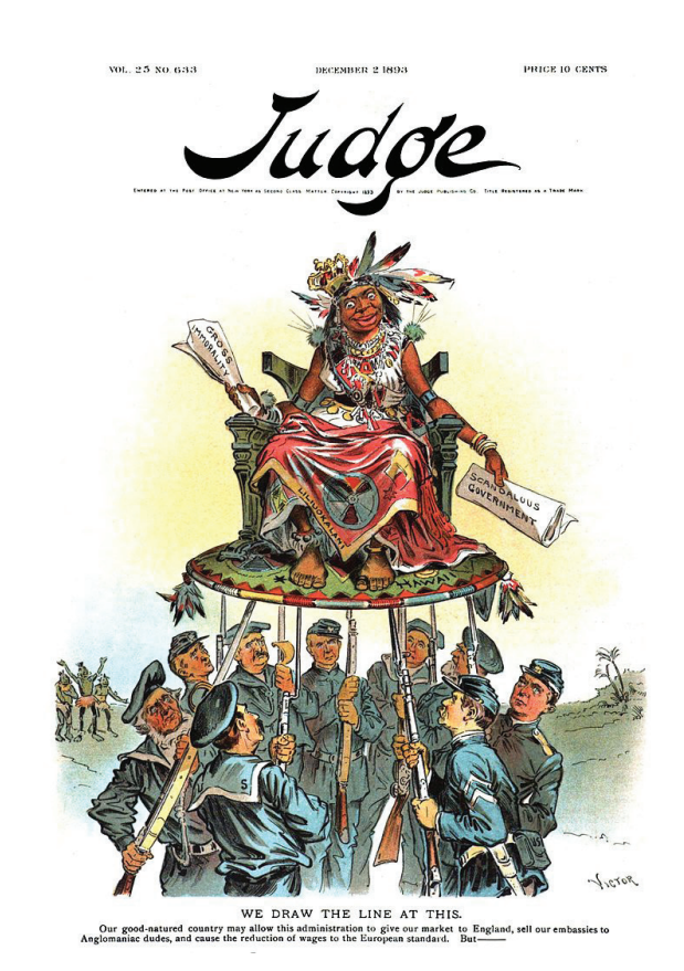
The December 1893 cover of Judge magazine featured a caricature of Queen Lili'uokalani being dethroned by armed American soldiers. The artist's aggressive imagery and the phrase "We draw the line at this" presented the event as a hostile takeover by the U.S. government.

Lili'uokalani in 1893. Why was the Hawaiian language banned? Did that action change the way native Hawaiians communicated with each other?